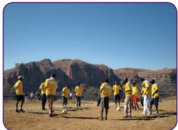
Figure 8: PIH staff and guests play soccer to celebrate the first year anniversary of a health facility in Lesotho

As part of regular planning, the supervisor and employee should review and revise the employee's job description as required. Using this document and the organization's (or department's) annual work plan as a guide, the supervisor and employee should jointly develop the employee's objectives for a designated length of time. The objectives of the organization's annual work plan can inform the employee's objectives. The plan should be in writing, and both parties should sign it. At the end of the designated period, the parties meet again to review the employee's performance against his or