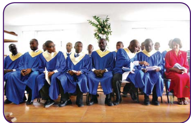
Figure 9: Twenty Zanmi Lasante physicians were honored in 2010 for their accomplishments and leadership in Cange, Haiti

Ideally, training programs and continuing educational support for health workers should be tied to certification, registration, and career progression mechanisms that are standardized and nationally endorsed (see Unit 6: Improving programs through training ). Clinical staff members at the site will most likely need in-country licensing or accreditation before beginning work. Look into how licensing and accreditation may differ for country nationals and expatriates. While each country has different requirements, clinical staff members typically need to present their existing license, CV, proof of academic credentials, and occasionally a police report.