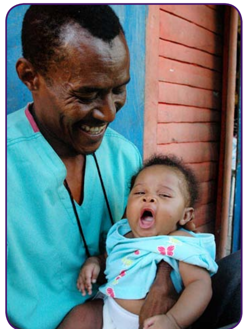
Figure 4: A Zanmi Lasante employee (and former patient) poses with his daughter in Haiti

PIH employs many former and current patients at the sites. Patients can make excellent CHWs because they know firsthand what problems and obstacles patients face every day, and they have a strong sense of empathy with those who are vulnerable or ill. In some cases, CHWs are themselves HIV positive or have been successfully treated for tuberculosis (TB). Check whether labor laws permit hiring patients if they would be working in a government-run facility.