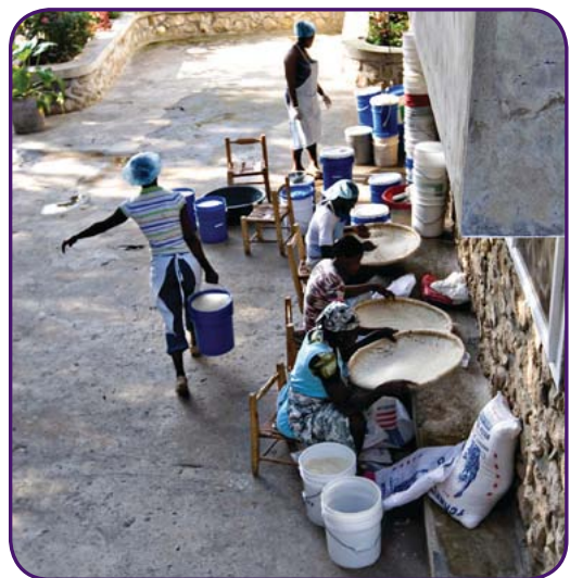
Figure 2: Zanmi Lasante employs local staff to prepare meals at the health facility in Cange, Haiti

Often the official government website will post information on labor laws, but it may be easier to speak directly with relevant parties in the government (MOH, Ministry of Labor, Ministry of Justice, or the person in charge of public administration). Other NGOs in the area may also have information to share about staffing and compensation practices. Consider hiring a local lawyer who can provide counsel on the intricacies of labor laws during the planning phase—and definitely before beginning the hiring process. Doing so can save time and resources in the long run. (See Unit 2: Understanding legal matters for more on hiring legal counsel.)