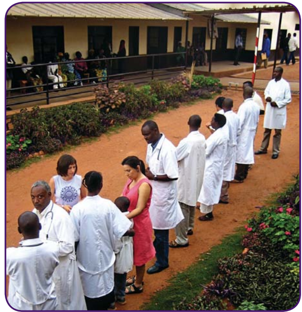
Figure 6: Rwinkwavu District Hospital staff, Rwanda

A common challenge associated with using national salary scales in your host country is that they are not always relevant to the situation of many NGOs. In areas where there are many NGOs, there is a more competitive market for certain kinds of jobs, particularly those requiring highly technical skills. In this situation, it may be hard to retain key staff who have received better offers elsewhere.