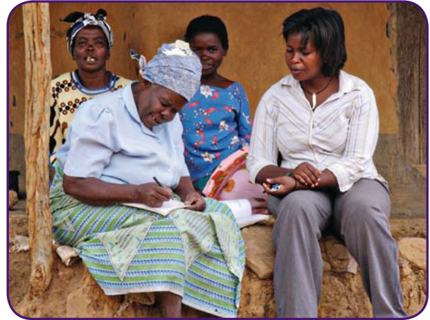
Figure 1: A village health worker in Malawi conducts a home visit

In response to the global shortage of healthcare workers, many governments have formally adopted the task-shifting model and have included it in their national strategic plan. It is important to understand how the regulatory framework of the host country might support or impede task shifting. National clinical protocols may restrict certain employees from performing certain tasks, which will affect the number and types of recruits. As part of the task-shifting initiative, some countries may have already conducted a human resource analysis that provides information on the demography of current human resources for health care in the public and private sectors, the gaps in service provision, and the existing human resource quality assurance mechanisms. These data, where they exist, will be extremely helpful for developing an HR plan and should be available from the MOH.