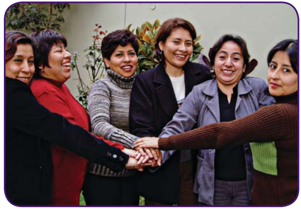
Figure 7: Nursing staff show their solidarity at Socios En Salud in Peru

should have a plan in place for dealing with them before they happen. Check whether local labor laws might affect processes and procedures relating to discipline, termination, and grievance. All staff should be made aware of these procedures as they apply to the organization. Formally document all matters relating to these procedures, since the law may require you to produce documentation if a conflict does arise.