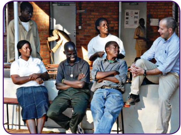
Figure 10: Hospital staff relax outside a PIH-supported health facility in Neno, Malawi

and rigorous work schedules. Other significant challenges include limited resources (such as essential medicines, supplies, and equipment), lack of a reliable communications network, political unrest, harsh climate, and working in isolation. Keep in mind that workers in an understaffed health clinic may be less than welcoming to a foreign nonprofit that wants to make improvements to the facility's infrastructure or service delivery because doing so can often attract many more patients and make their jobs even more difficult.