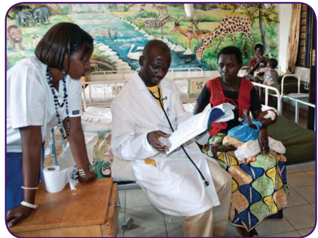
Figure 5: The pediatric ward at the Rwinkwavu District Hospital in Rwanda

Orienting new employees is one way to help new staff members feel welcome and to assimilate them into a new working environment. It provides an opportunity for others within the organization to meet the new staff member and learn about his or her role and, correspondingly, gives the new hire details on the organization's programs and the specifics of his or her job. Even if your orientation program is informal, consider what activities should be involved, when they take place, how often and where they occur, who should be responsible for conducting the orientation, what the duration of the program should be, and whether or not participation is required.